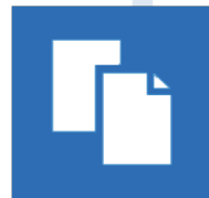
Paper and Pulp